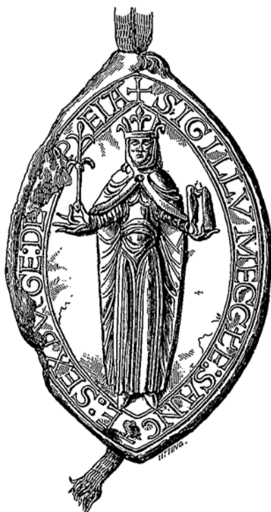
SEAL OF THE PRIORY OF MINSTER IN SHEPPEY, FROM A CHARTER OF THE DEAN AND CHAPTER OF CANTERBURY.